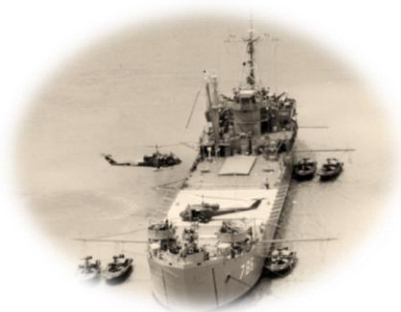
USS Garrett County supporting operation “Game Warden,” Mekong Delta, South Vietnam, 1968.

During Vietnam , the Navy’s involvement in the region and on its waters encompassed supporting medical needs, providing fire support for troops ashore, collecting intelligence, and much more. These efforts put the Navy at the forefront of every operation and logistical plan for achieving America’s goals and regional stability in Southeast Asia. Sailors and Naval officers were pivotal in meeting America’s strategic, operational, and tactical objectives ashore, on waterways and at sea, as well as in the air. Their contributions have had a lasting impact in shaping the legacy and modernization of today’s U.S. Navy. You can read more about all these operations, including humanitarian efforts and their enduring legacy via our newly unveiled poster series, The U.S. Navy in the Vietnam War .