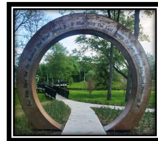
Arch in Vietnam Veterans Memorial Park in Trumbull, CT.

This quote (source unknown) is inscribed on the arch shown at right, surrounding the entrance to the Vietnam Veterans Memorial Park in Trumbull, Connecticut. Recently completed, the arch is a powerful tribute to all who gave their lives defending our Nation’s freedom in uniform, especially our Vietnam veterans.