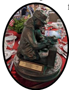
2021 Founder’s Award

Rounding out the year, on December 17 we accepted— on your behalf —the 2021 Founder’s Award from another of our remarkable Commemorative Partners, Wreaths Across America . This award recognizes those who “exemplify the mission to Remember, Honor, and Teach,” and who show active support of our Nation’s military and veterans. You, as partners with us in this noble mission, exemplify each of those traits. Congratulations!