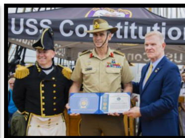
*Commonwealth of Australia