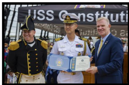
*Republic of Korea

We also took this opportunity to recognize the contributions and sacrifices of 3 of our 5 allies in the Vietnam War –