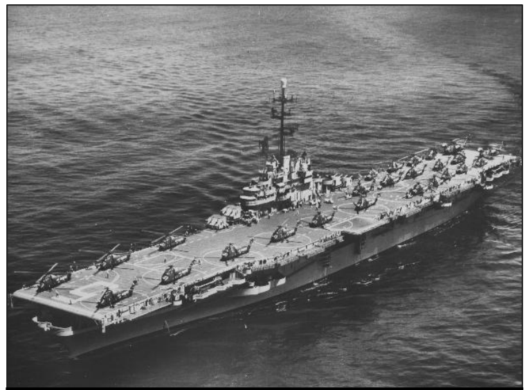
The USS Princeton (LPH-5) from which HMM-362 deployed to Vietnam in April 1962.

Former Army Chief Staff General Maxwell Taylor, then serving on Kennedy's personal staff, headed the most notable of these missions. Taylor, along with an entourage of White House, State Department and Pentagon officials, visited Vietnam in late October 1961. A report of the Taylor mission was presented to the president upon Taylor's return to Washington in early November. The report recommended increased military aid to South Vietnam in several areas, including providing aerial reconnaissance and air transport support, both fixed wing and helicopter, for the Vietnamese armed forces. The most far-reaching recommendation, however, was for the U.S. to offer to send military troops to Vietnam.