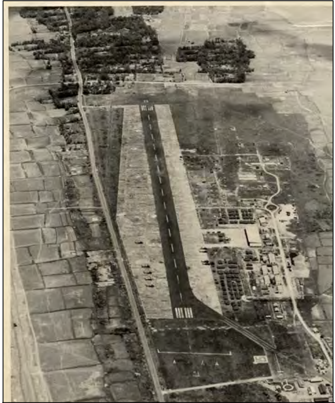
Soc Trang airfield, SHUFLY's base of operations during the early days of the Vietnam War.