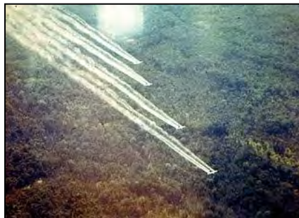
13 January: U.S. begins herbicide spraying in Vietnam

We have asked the OSD history office to provide us a DoD perspective on the start of the Vietnam War, but it is important to understand we are not commemorating the “start” of the Vietnam War. We are commemorating the 50 th anniversary of the Vietnam War and our number one objective is to thank and honor the service, valor and sacrifice of all Vietnam War veterans and their families, irrespective of an official start date.