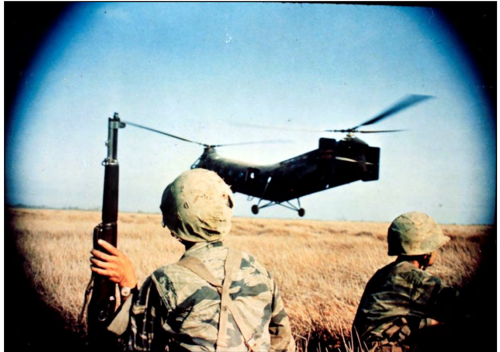
Vietnamese Marines wait to be picked up by U.S. Army CH-21 "Shawnee" troop-carrying helicopters during a recent operation in the Plain of Reeds area. Photo circa April 1963.

Contact us at: 1401 Wilson Blvd, Ste. 400 Arlington, VA 22209 Phone: 1- 877-387-9951 Email: vnwar50th@wso.whs.mil