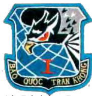
1st Air Division Republic of Vietnam Air Force