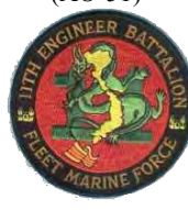
11th Marine Engineer Battalion