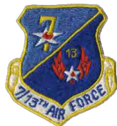
7/13th Air Force