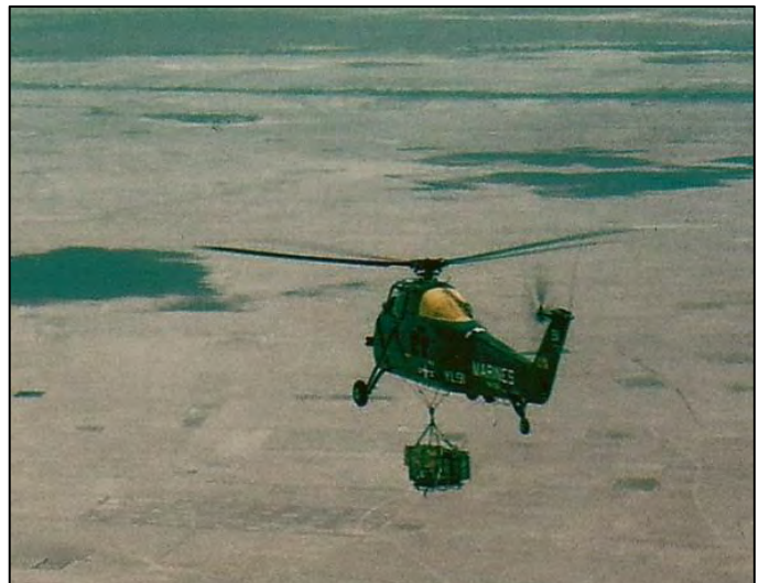
One of HMM-362s helicopters, with supplies slung beneath, flies from the USS Princeton into the Soc Trang airbase on April 15, 1962.