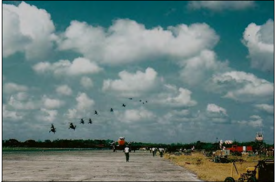
HMM-362 returns to the Soc Trang airbase following a mission during its 1962 deployment to Vietnam.