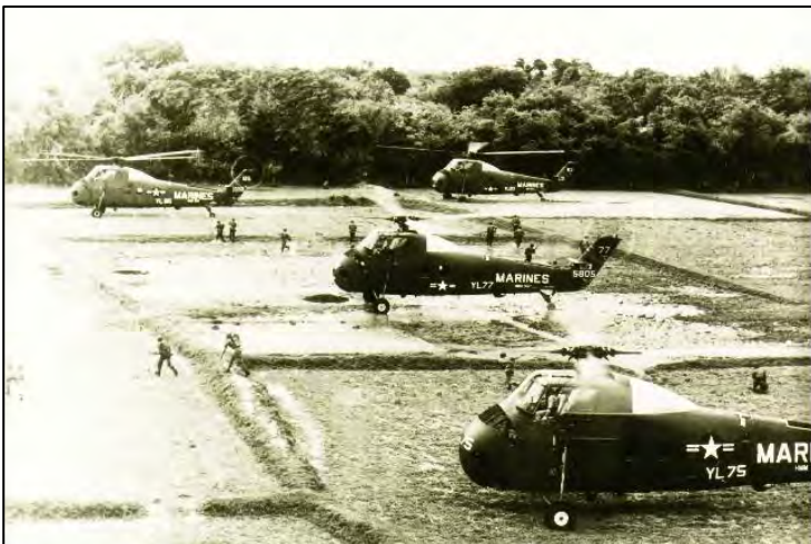
HMM-362 helicopters transport ARVN Soldiers into a landing zone during operations near Soc Trang in 1962.