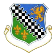
834th Air Division