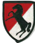
11th Armored Cavalry Regiment