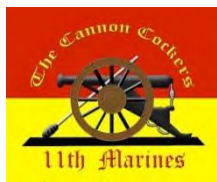
11th Marine Artillery Regiment