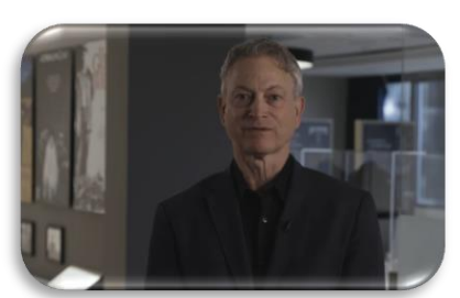
Gary Sinise video recognizing National Vietnam War Veterans Day

Top social media content – on Facebook, our Gary Sinise <u>Happy Birthday post</u> reached more than