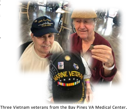
Three Vietnam veterans from the Bay Pines VA Medical Center, St. Petersburg, FL, proudly display their Vietnam Veteran Lapel Pins received during the fall of 2019.

Pictured below is the 2019 Veterans Day Poster , designed by the graphics experts at the Department of Veterans Affairs . This poster can be downloaded by visiting the VA's Office of Public