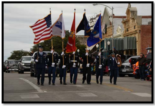
Joint Service Color Guard marches during Veterans Day Parade in San Angelo, Texas, Nov. 10, 2018.

Thank you, for your continued leadership, dedication and focus on Vietnam veterans and their families, especially during the upcoming celebration across the Nation of Veterans Day, November 11. We are grateful for your determination to honor all veterans living in America and abroad on this special day. We also appreciate your efforts to bring attention to veterans who served during the Vietnam war and have waited so long for the honor rightly due them for their service and sacrifice.