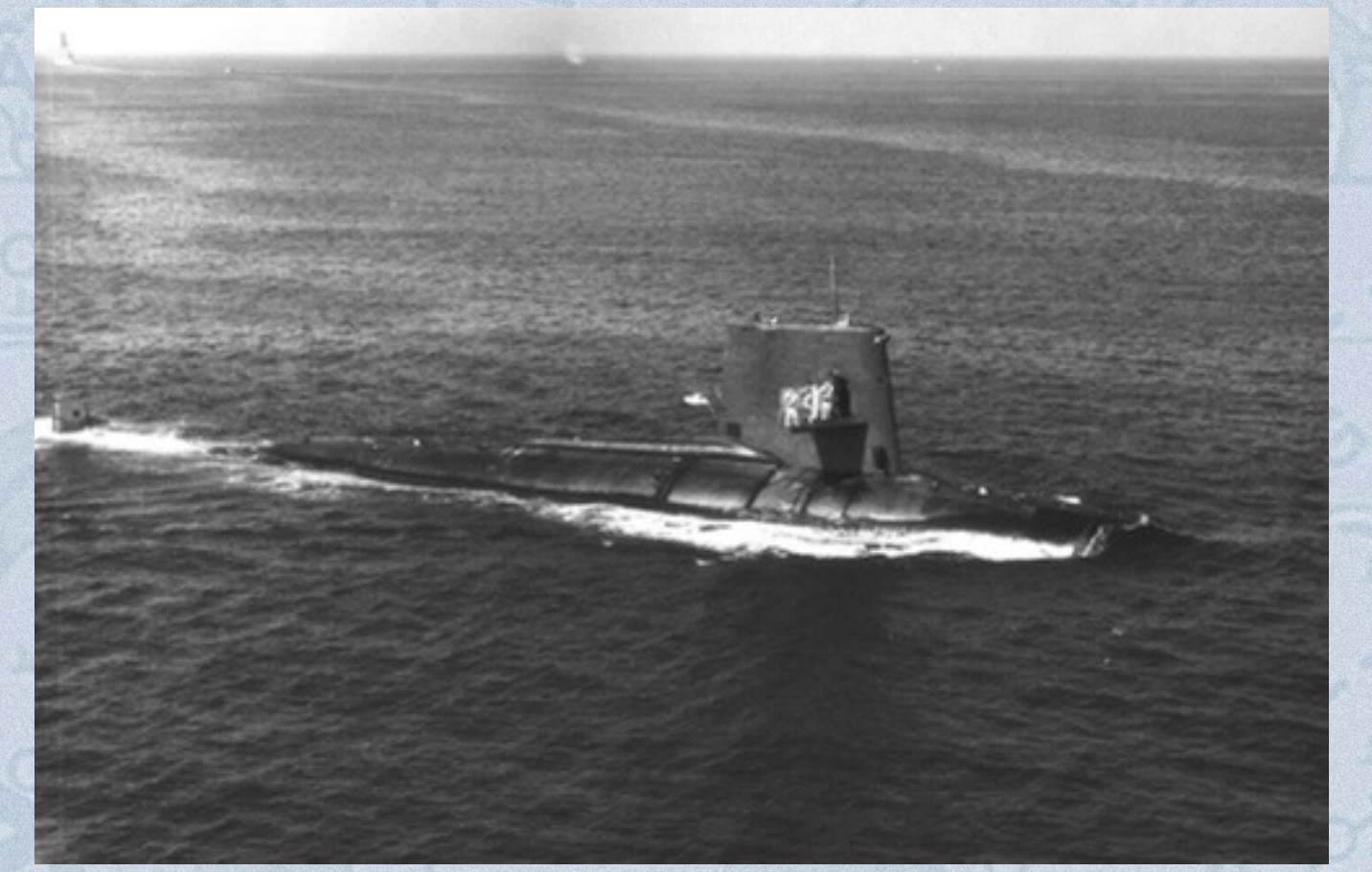
Coordinated operations. U.S. submarines such as USS Sculpin (SSN-591) collected intelligence along routes used by gun runners, while Navy planes like the P-5 Marlin, P-2 Neptune, and P-3 Orion reported live contact locations to the surface vessels.

USS Garrett County (LST-786). A Bell UH-1E Hueys of Helicopter Attack (Light) Squadron 3 Seawolves lands while providing support for operation "Game Warden" Forces in the Co Chien River, Mekong Delta, South Vietnam, June 1968. Five river patrol boats are alongside.