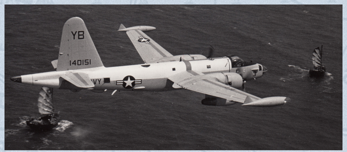
Intelligence by Land, Sea, and Air. An SP-2H Neptune flies low over junks at sea during surveillance patrols supporting Operation MARKET TIME in 1966. In the skies, naval aircraft photographed enemy positions and monitored enemy activity. Their capabilities included wide angle lenses, night vision, radar, infrared cameras and electronic intercepts.

Relying on coordinated intelligence networks, U.S. Navy ships destroyed or captured hundreds of tons of supplies on their way into South Vietnam. By 1967, Operation MARKET TIME limited all but less than five percent of Communist arms and equipment transported by sea. MARKET TIME's effectiveness forced the North Vietnamese to supply the Viet Cong by other means, increasing their use of the Ho Chi Minh Trail.