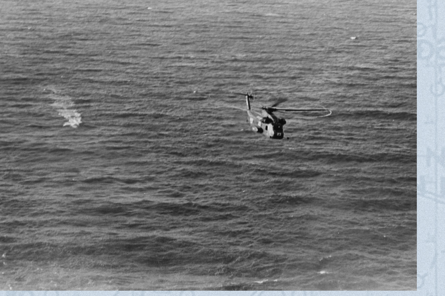
Operation END SWEEP. A CH-53A Sea Stallion tows a Magnetic Orange Pipe (MOP) to detect mines for clearing Haiphong Harbor. To reduce collateral damage after U.S. demands were met in peace negotiations, U.S. Navy ships and aircraft cleared Vietnamese waters of mines.

Elmo Zumwalt discusses issues of racial inequality with sailors aboard the USS Kitty Hawk (CV-63). Racial issues aboard U.S. Ships peaked alongside the civil rights movements within the U.S. Navy-wide racial reforms were instituted to create a fair environment for sailors of all backgrounds