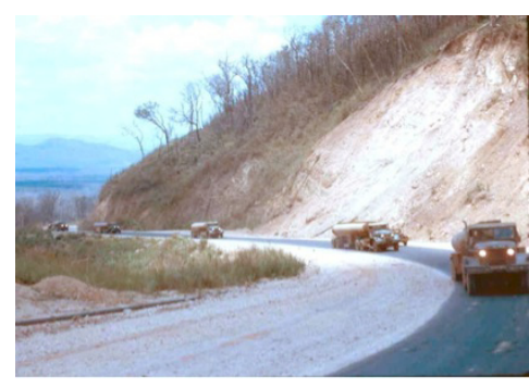
An Khe Pass

On February 23, 1971 elements of the 27th Transportation Battalion left Pleiku with a convoy of 5,000-gallon jet fuel tanker trucks. The tankers were broken down into several groups and escorted by gun trucks. As one group approached the top of the An Khe Pass, an NVA company of about 50 soldiers initiated an ambush by disabling the gun truck Creeper , blowing out its tires with a rocket and hitting one of the fuel tankers which began to burn.